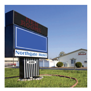
Northgate Inn 6300 Bay Road