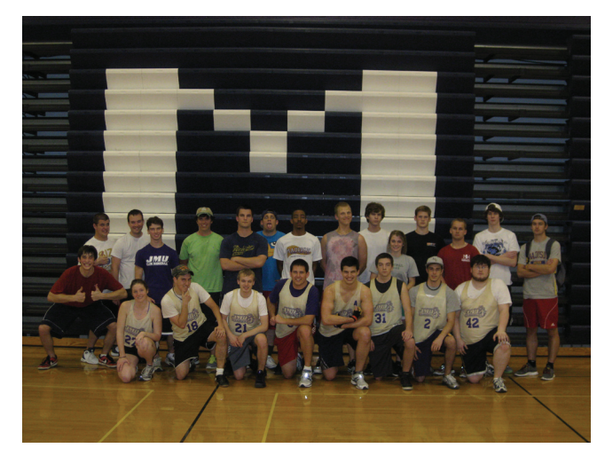
After joining the NCDA this year and placing sixth in the final season standings, JMU attends it's first Nationals.